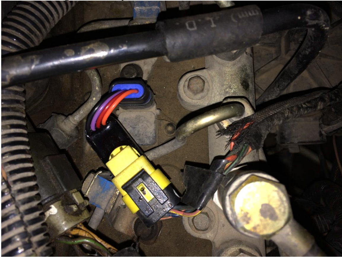
Step 4 Plug the Factory Harness into the Yellow Connector

After you have plugged the factory harness into the yellow connector on the Boost Fooler you are done! As stated earlier the Boost Fooler was designed to be "Plug and Play" for a simple and fast installation.