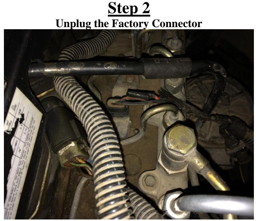
Unplug the factory connector from the MAP sensor