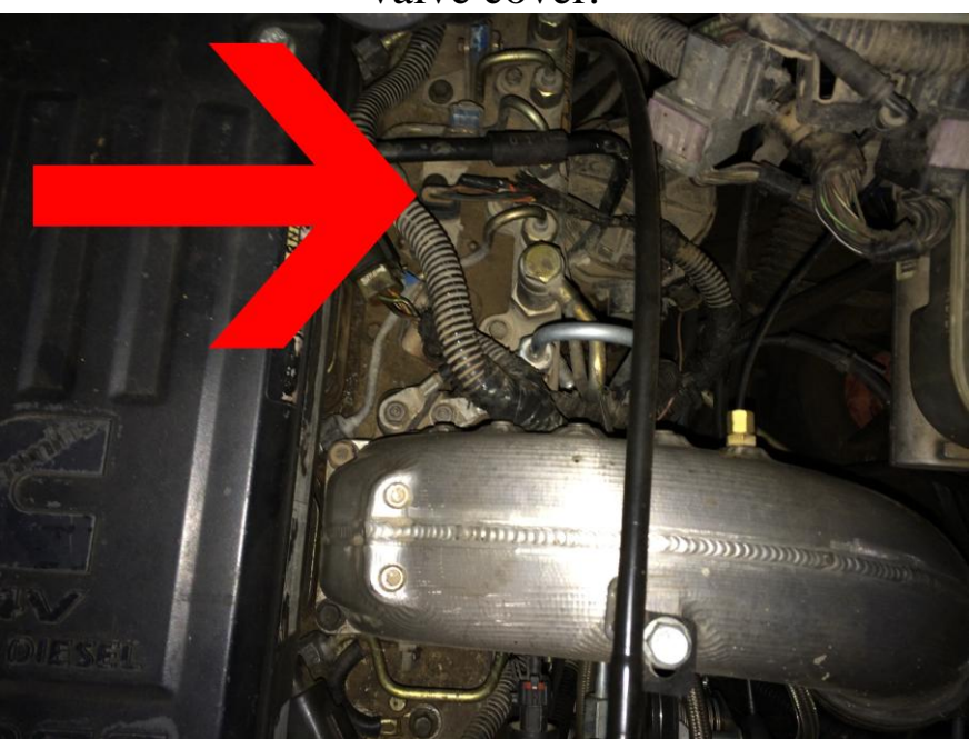
Here you can see the factory wiring harness and connector plugged into the MAP sensor