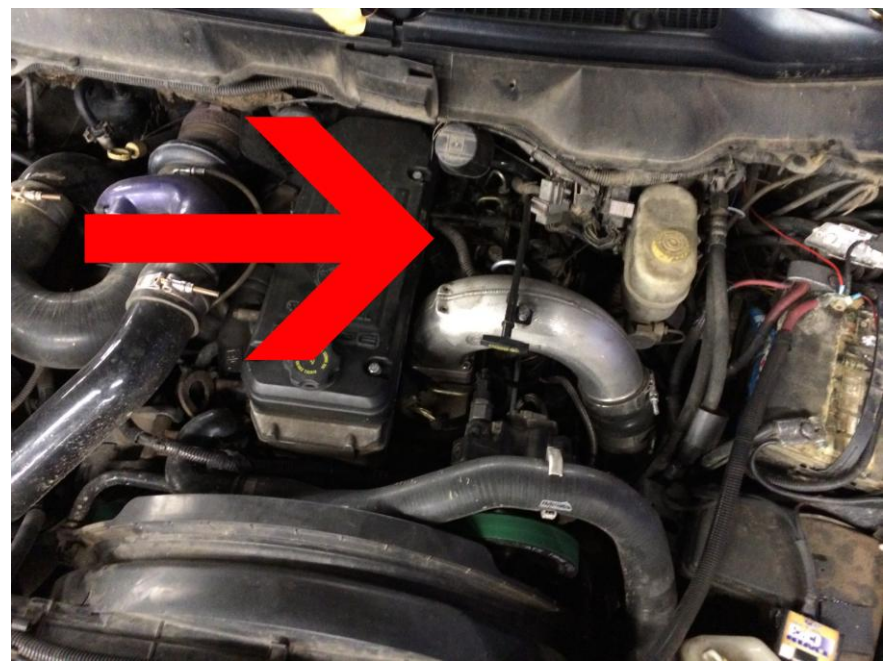
The sensor is located just behind the intake horn to the right of the valve cover.