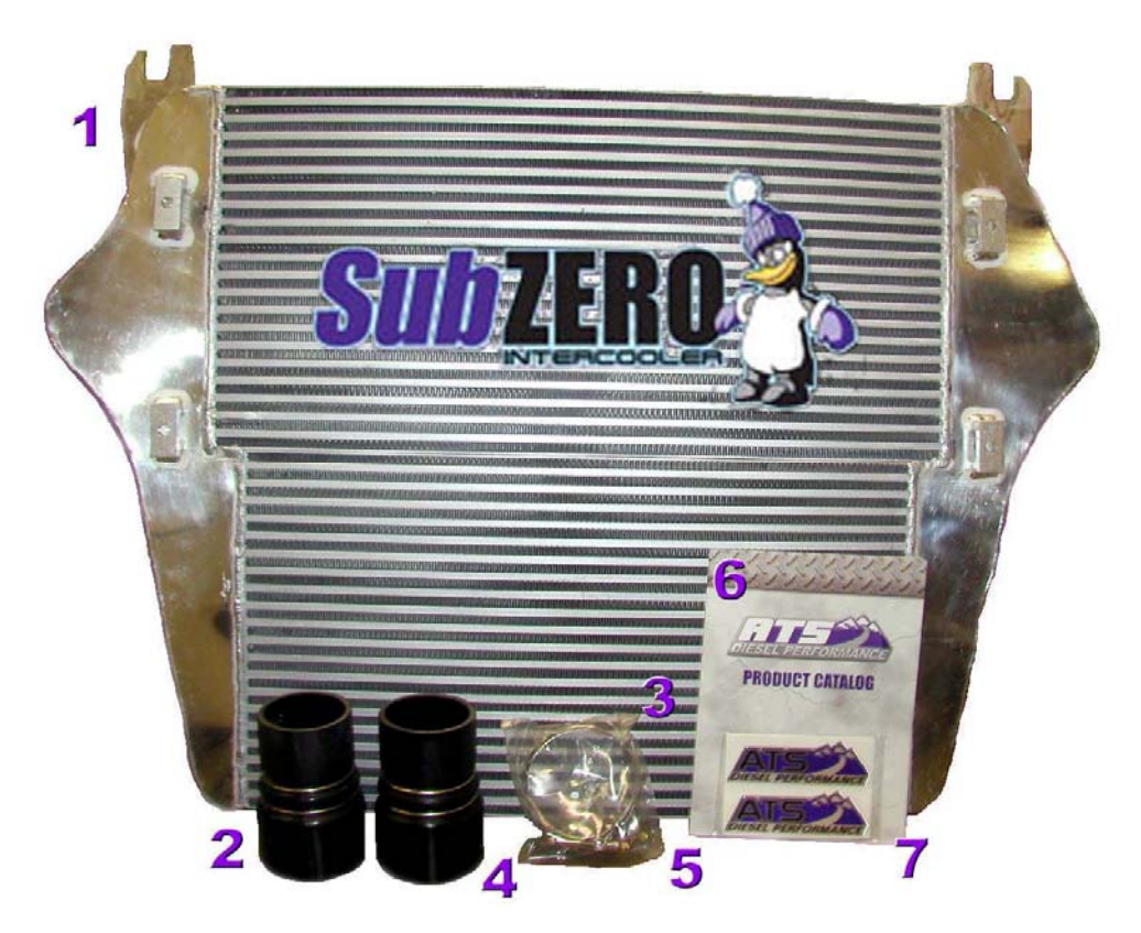
Figure 1 - ATS Sub Zero Intercooler Kit

Warning: If the engine was just turned off, the air intake system tubes may be hot!