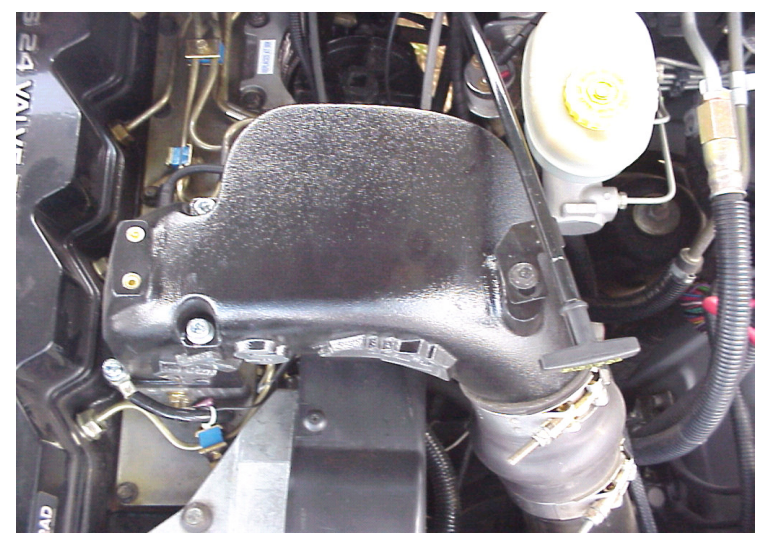
Figure 4 - Arc-Flow Intake Manifold After Installation

Note: Figure 4 shows a 24V Cummins, but 12V and Commonrail models look similar.