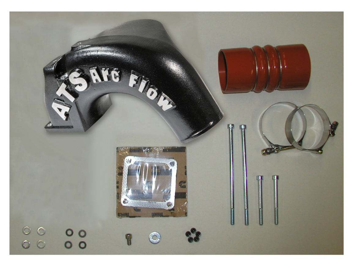
Figure 1 - Common Rail ArcFlow Kit contents

Thank you for purchasing the ATS Arc-flow Intake Manifold. This manual is to assist you with your installation. If installing for a customer, please pass this manual on to your customer for future reference.