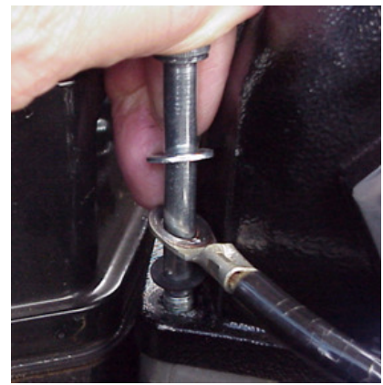
Figure 3 - Installing Ground Wire, Note Rubber Washer Below Ring Terminal