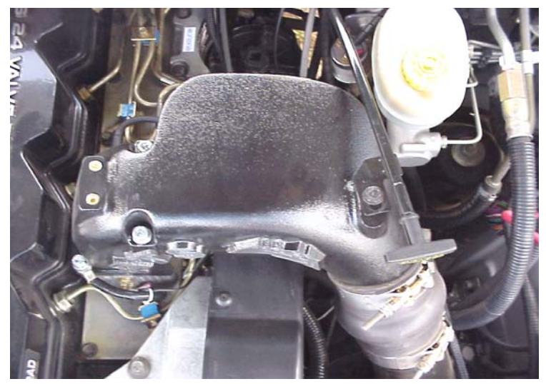
Figure 4 - Arc-Flow Intake Manifold After Installation

Note: Figure 4 shows a 24V Cummins, but 12V and Commonrail models look similar.