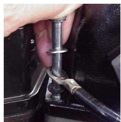
Figure 3 - Installing Ground Wire, Note Rubber Washer Below Ring Terminal