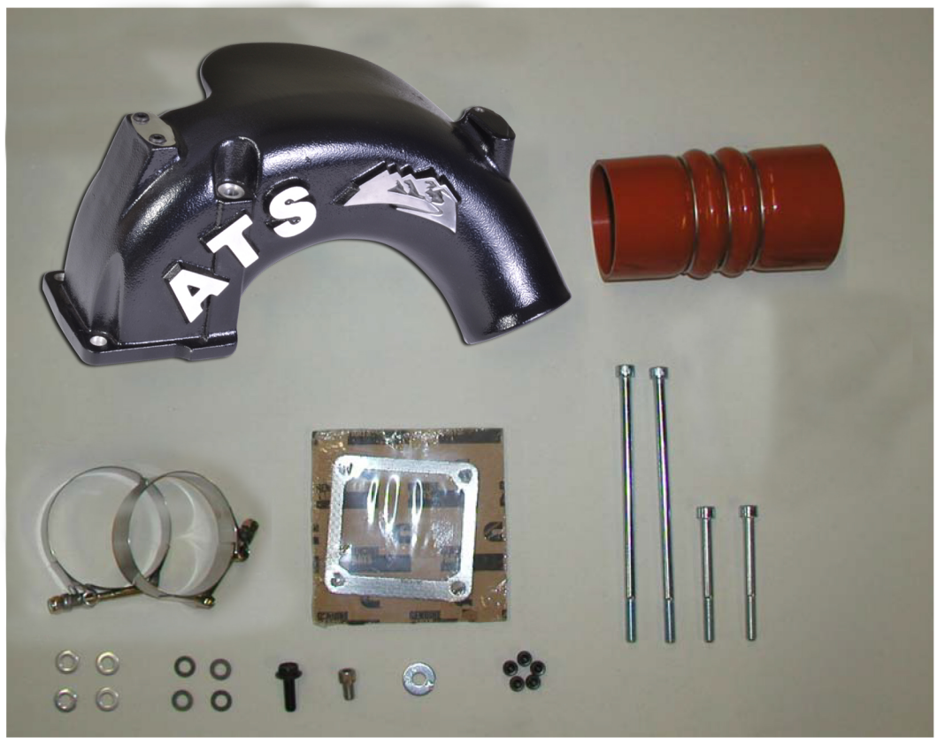
Figure 1 - 12 Valve Arc Flow Kit Contents

Thank you for purchasing the ATS Arc-flow Intake Manifold. This manual is to assist you with your installation. If installing for a customer, please pass this manual on to your customer for future reference.