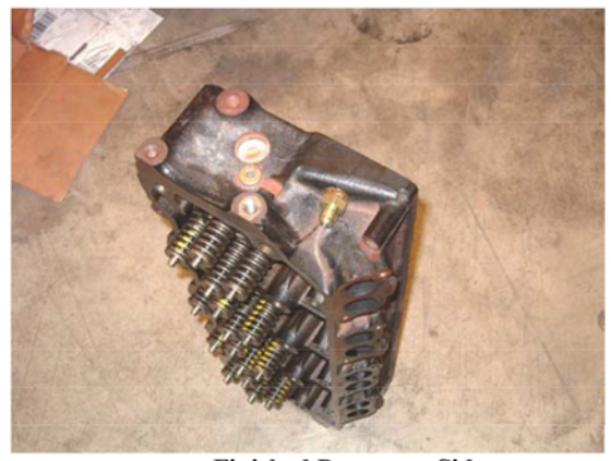
Finished Passenger Side