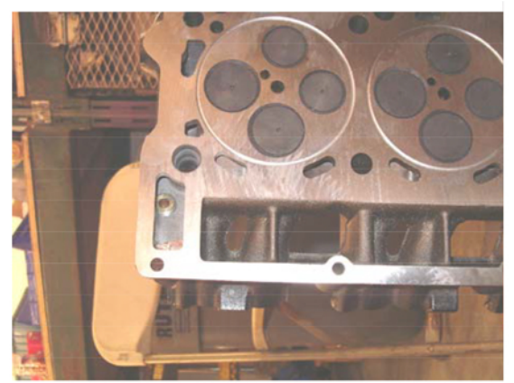
Fitting will be offset to water jacket port