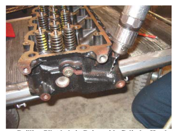
Drilling Pilot hole in Driver side Cylinder Head

1. Reference the supplied photo for location of coolant return fitting. Drill pilot hole in desired location, progressively drill to a size of 7/16". Tap hole with 1/4-18" NPT tap. Install fitting with thread sealant. Perform operation to other cylinder head.