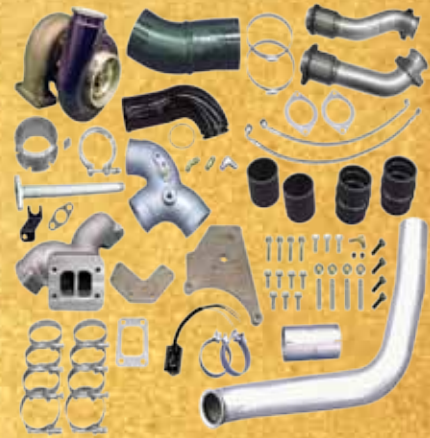
ATS Aurora 3000 Turbo Kit

In addition, the Aurora 3000 will lower your EGTs, increase performance and give you better fuel economy. Best of all, right now, we have an excellent inventory of 3000s. We can ship one out to you tomorrow if you wish, or stop in at any of our more than 500 authorized dealers across the U.S.