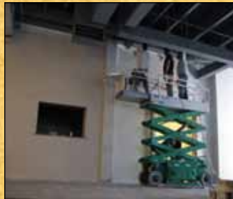
Months of construction