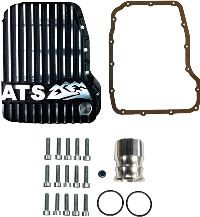
Figure 1 - 68-RFE Deep Pan Kit Contents

! PLEASE READ ALL INSTRUCTIONS BEFORE INSTALLATION.