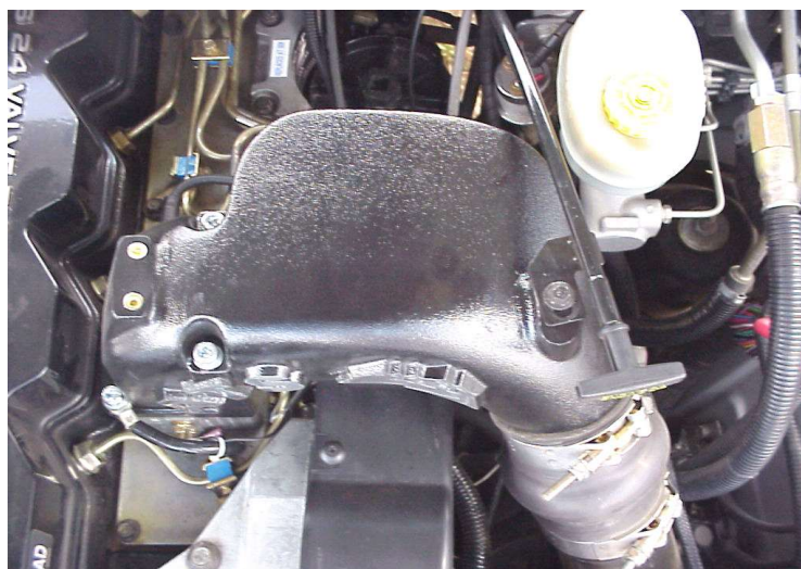
Figure 4 - Arc-Flow Intake Manifold After Installation

Note: Figure 4 shows a 24V Cummins, but 12V and Commonrail models look similar.