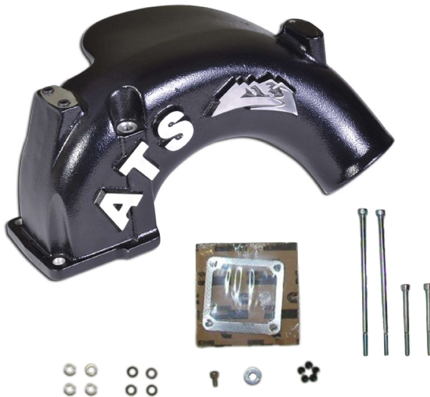
Figure 1 - 24-valve ArcFlow Kit contents

Thank you for purchasing the ATS Arc-flow Intake Manifold. This manual is to assist you with your installation. If installing for a customer, please pass this manual on to your customer for future reference.