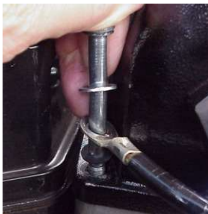
Figure 3 - Installing Ground Wire, Note Rubber Washer Below Ring Terminal