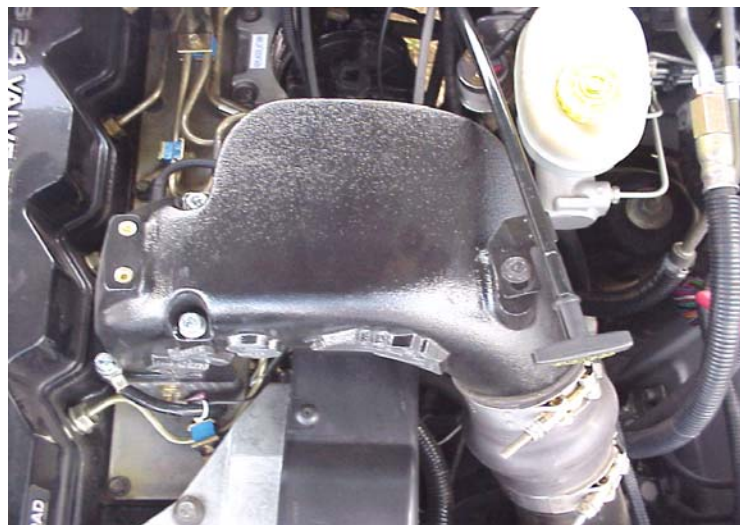
Figure 4 - Arc-Flow Intake Manifold After Installation

Note: Figure 4 shows a 24V Cummins, but 12V and Commonrail models look similar.