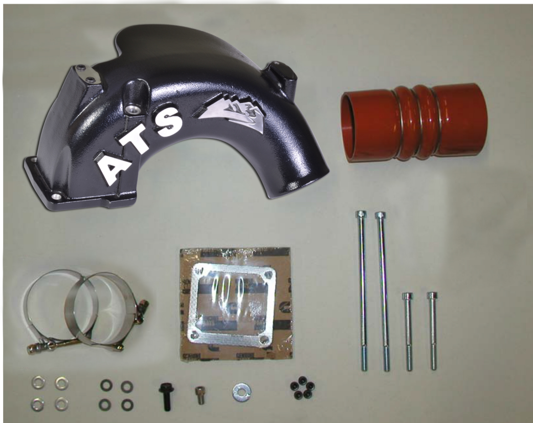
Figure 1 - 12 Valve Arc Flow Kit Contents

Thank you for purchasing the ATS Arc-flow Intake Manifold. This manual is to assist you with your installation. If installing for a customer, please pass this manual on to your customer for future reference.